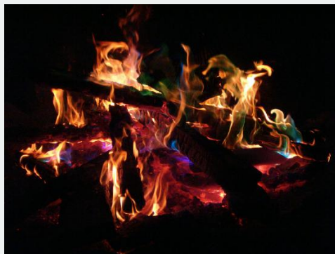
An image of a campfire with colored flames, made by the burning of a garden hose in a copper pipe.

A campfire is an example of basic thermochemistry. The reaction is initiated by the application of heat from a match. The reaction converting wood to carbon dioxide and water (among other things) continues, releasing heat energy in the process. This heat energy can then be used to cook food, roast marshmallows, or just keep warm when it's cold outside.